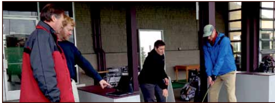
At Interbay Golf Center in Seattle, golf instructors are able to use their iPad to check the lesson.

PREMIER GOLF CENTERS • premiergolfcenters.com Interbay, Jackson Park, Jefferson Park, West Seattle, Bellevue GC, Lake Wilderness GC, Walter E. Hall, Legion Mem., Cedarcrest, Lynnwood GC, Lake Padden GC & Crossroads Par 3 GC